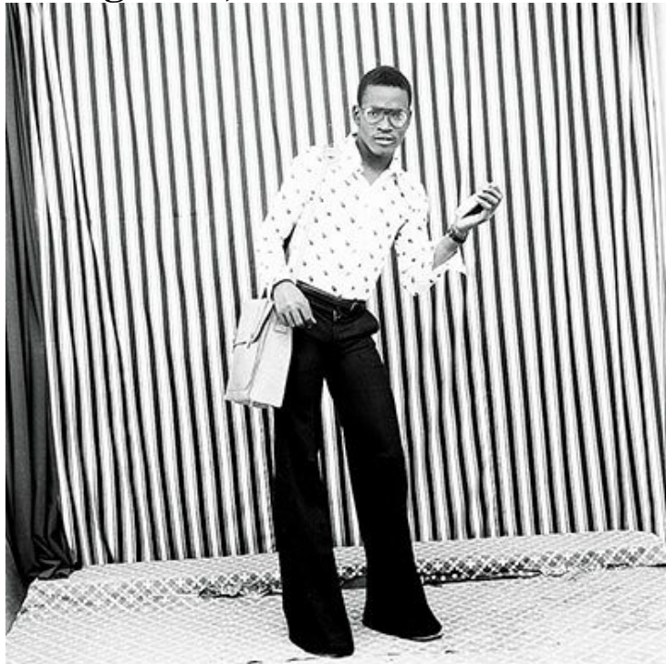
Photograph: Courtesy the artist, Andre Magnin and Tristan Hoare