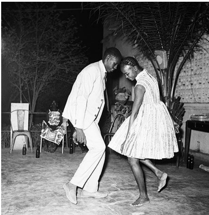
Photograph: Courtesy the artist, Andre Magnin and Tristan Hoare