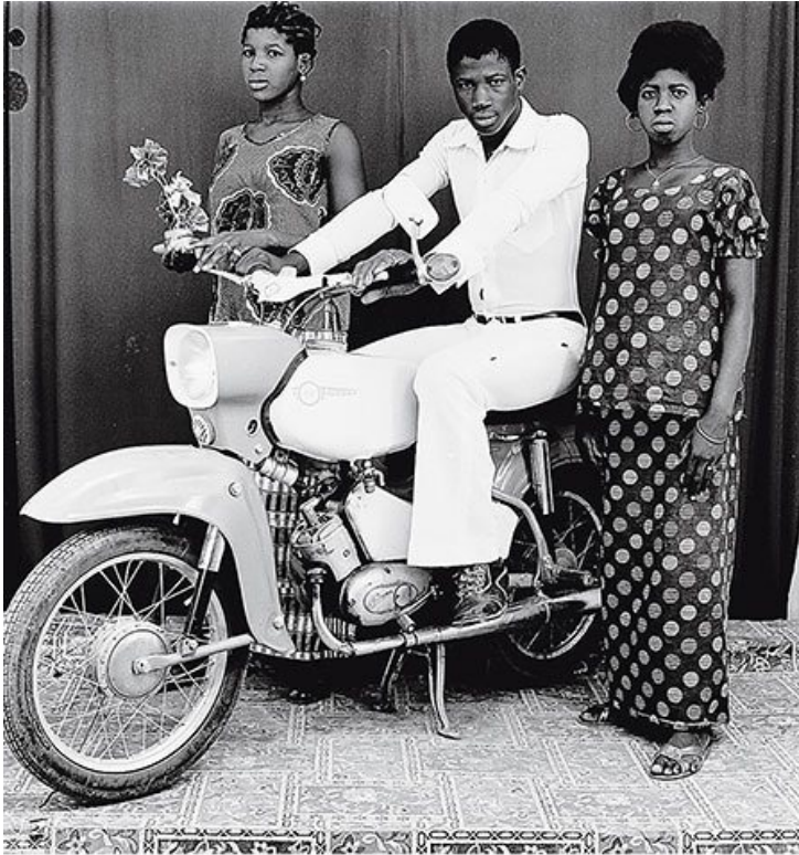
Photograph: Courtesy the artist, Andre Magnin and Tristan Hoare

https://www.theguardian.com/artanddesign/gallery/2010/feb/27/malick-sidibe-photographs