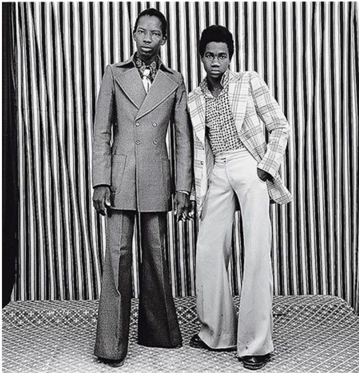
Photograph: Courtesy the artist, Andre Magnin and Tristan Hoare