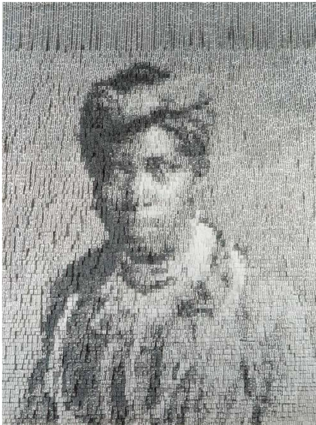
The African Choir, 2016.