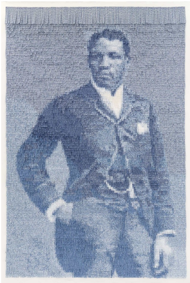
Peter the Great II, 2015.