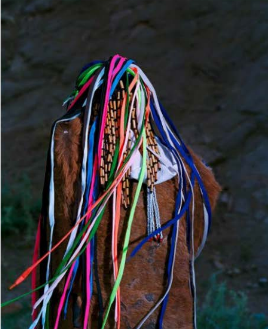
From the series Kingdom of Mountain, Namsa Leuba.