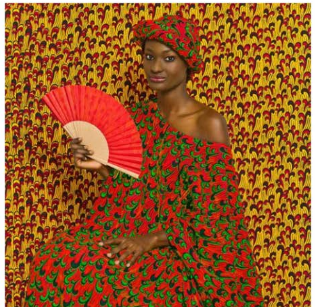
Omar Victor Diop / Courtesy Magnin-A, Paris.