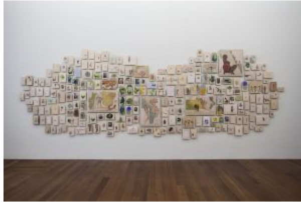
Firelei Báez, Bloodlines