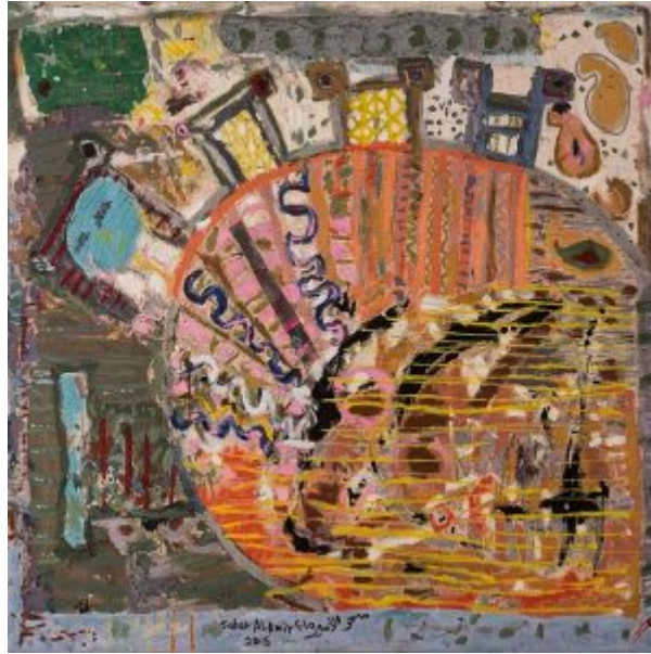
Sahar Alamir N/A

Pulse Art Fair Indian Beach Park 4601 Collins Ave Miami Beach 33139