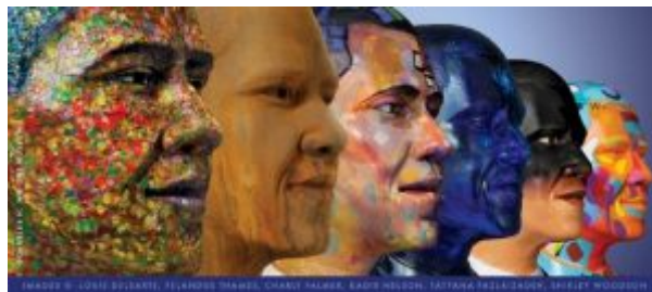
Visions of Our 44th President

Visions of Our 44th President is a collective sculptural show created to recognize and celebrate the historical significance of the first African-American President of the United States of America. Forty-four contemporary African American artists (renowned and emerging), participated in the avant-garde art collaboration with the Charles H. Wright Museum of African American History and Peter Kaplan of Our World, LLC., to create this wonderful view into the images of our 44th President. Dynamic and inspiring, the exhibition includes 44 artists' interpretations of President Barack Obama in life-size, three-dimensional busts that were sculptured by Matthew Gonzales for Our World, LLC. Purchase tickets here .