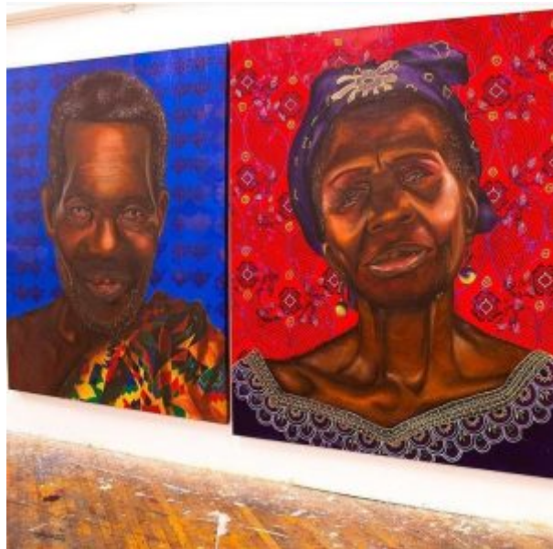
Work by Solomon Adufa. Mr. Adufa will exhibit with Art Africa Miami

Miami's Black artist community is a major part of the fabric of South Florida. The Greater Miami Beach Visitors' and Conventions Bureau began an initiative to promote local fairs, and exhibits. The selection is large and varied: you can visit Kroma Gallery in historic Coconut Grove or visit Art Africa Miami in Overtown, or take in Caribbean Flora in Little Haiti. Find over 20 local activities here .