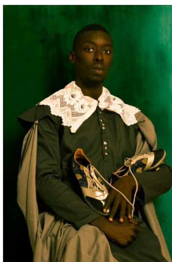
Omar Victor Diop, Juan de Pareja (1606 – 1670)