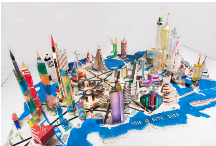
Bodys Isek Kingelez. Ville de Sète 3009. 2000. Paper, paperboard, plastic, and other various materials, 31 1/2 × 9' 10 1/8" × 6' 10 11/16".

Towards the end of his career, Kingelez's work grew more adventurous in terms of scale and material composition. MoMA points to Nippon Tower (2005) as a particularly idiosyncratic architectural model by the artist, built of "a plastic Smint box, packaging from a milk carton, BIC razor blades, light bulb boxes, and a playfully shaped spoon."