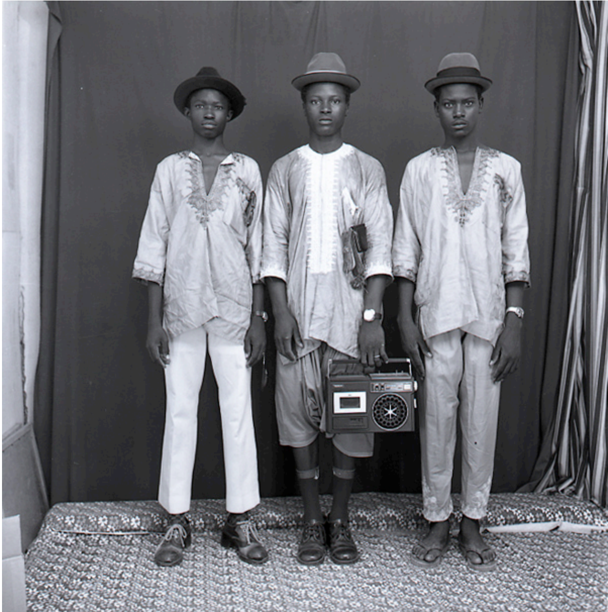
Malick Sidibé Les jeunes bergers peulhs, 1972 Tirage argentique baryté Papier : 50 x 60 cm Signé et daté

Somerset House today (6th Oct) opens up its doors to the first major solo exhibition in the UK to the late Malick Sidibé. The Eye of Modern Mali is part of the larger 1:54 Contemporary African Art Fair and a joint collaboration with MAGNIN-A Gallery, Paris.