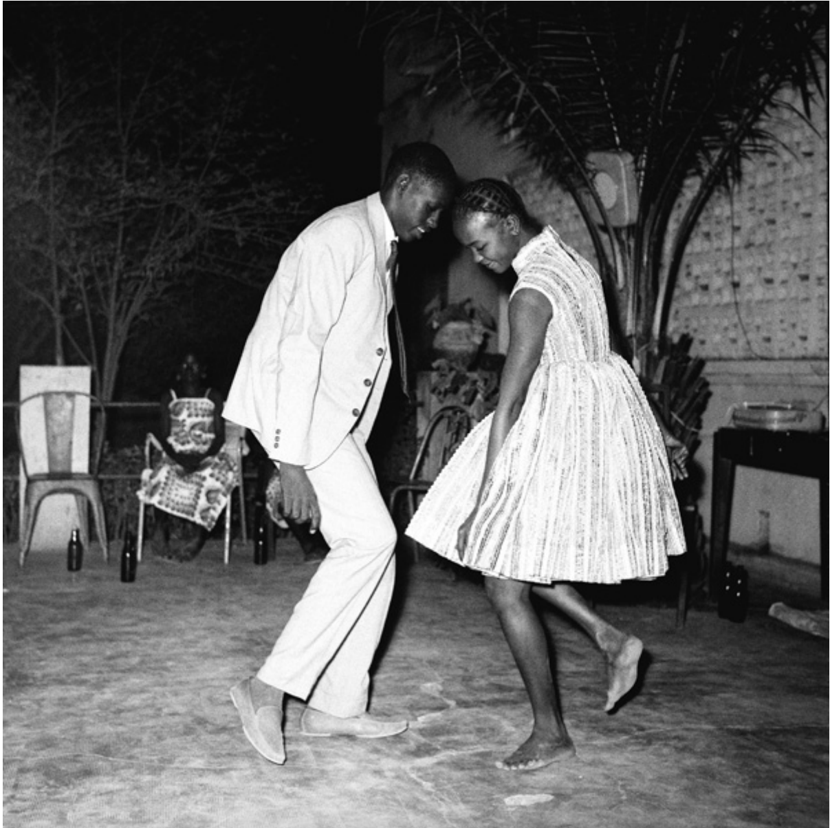
Malick Sidibé Nuit de Noël (Happy Club) , 1963 Tirage argentique baryté Image : 100x 100 cm. Papier : 120 x 120 cm Signé et daté

capital Bamako were still celebrating the country's independence. The show is curated by Andre Magnin and Philippe Boutte and will show over 40 of Sidibé prints taken during the 1960's and '70's. The exhibition is split into three themes and across three separate rooms – each reverberating to the specially commissioned audio track by Rita Ray. It was Sidibé's proclamation that 'music freed us'.