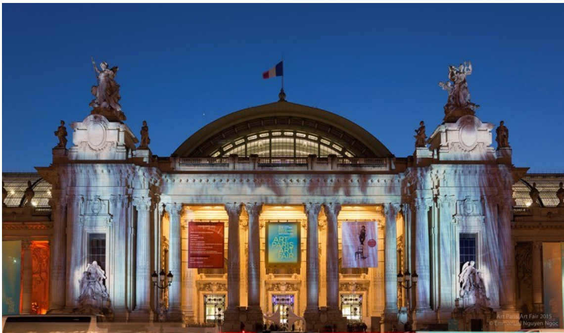
Art Paris Art Fair 2015

One of the European most significant art fairs – Art Paris art fair – is about to be launched soon! Art Paris Art Fair presents an overview of art from the post-war period to the present day. The thematic sections focus on discovery in particular with this year’s Korea guest of honor project, personal exhibitions in the Solo Show section, emerging talents with the Promises section for young galleries and digital art with monumental projections on the façade of Grand Palais. This year’s edition brings together 143 galleries from 20 countries which includes for the first time Azerbaijan, Colombia and Iran. With 58 newcomers, the 2016 edition maintains the 48% of foreign galleries and 52% of French galleries.