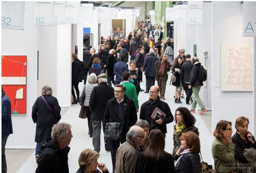
Art Paris Art Fair during its 2015 edition

from the 1980s onwards along with a number of new rising talents.