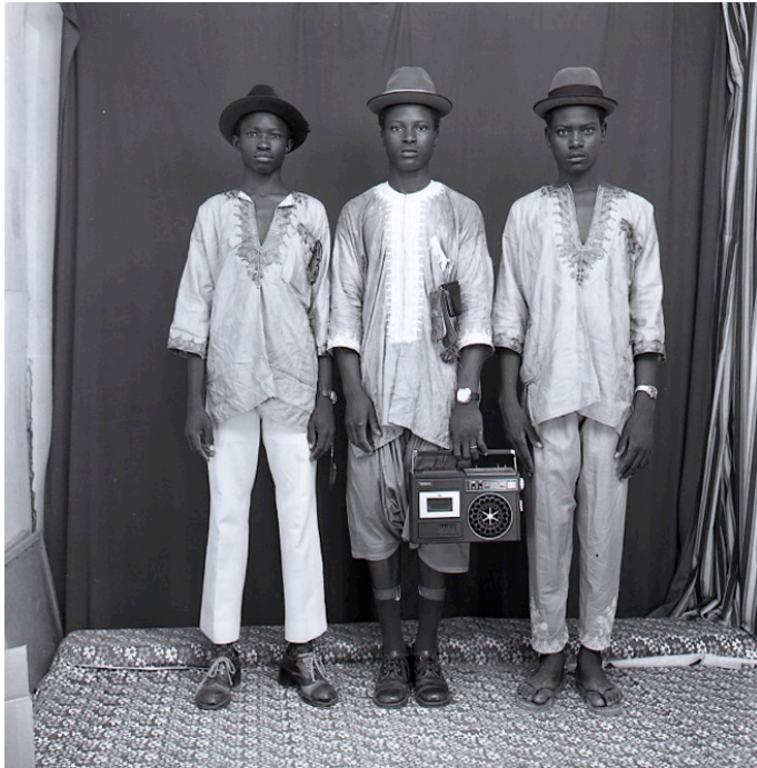
Les jeunes bergers peulhs, 1972 Tirage argentique baryté

Malick Sidibé: The Eye of Modern Mali presented by Somerset house in collaboration with MAGNIN-A Gallery, Paris, opens the Contemporary African Art Fair and is on until 15 January 2017.