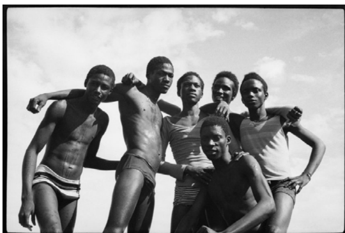
A la plage, 1974 Tirage argentique baryté © Malick Sidibé Courtesy Galerie MAGNIN-A, Paris