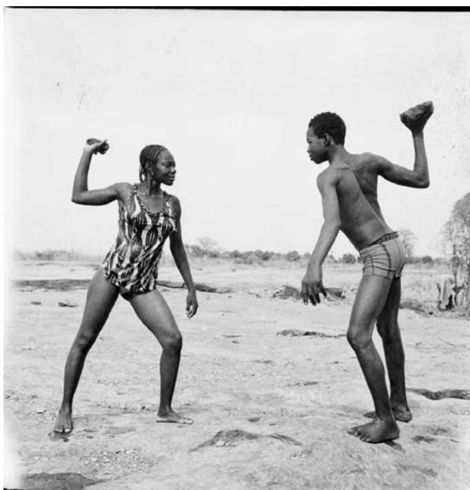
Combat des amis avec pierres, 1976 Tirage argentique baryté