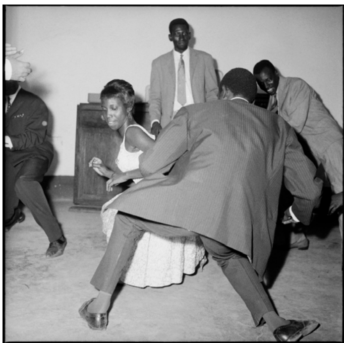
Dansez le Twist, 1965 Édition illimitée courtesy Magnin-A, Paris © Malick Sidibé Courtesy Galerie MAGNIN-A, Paris