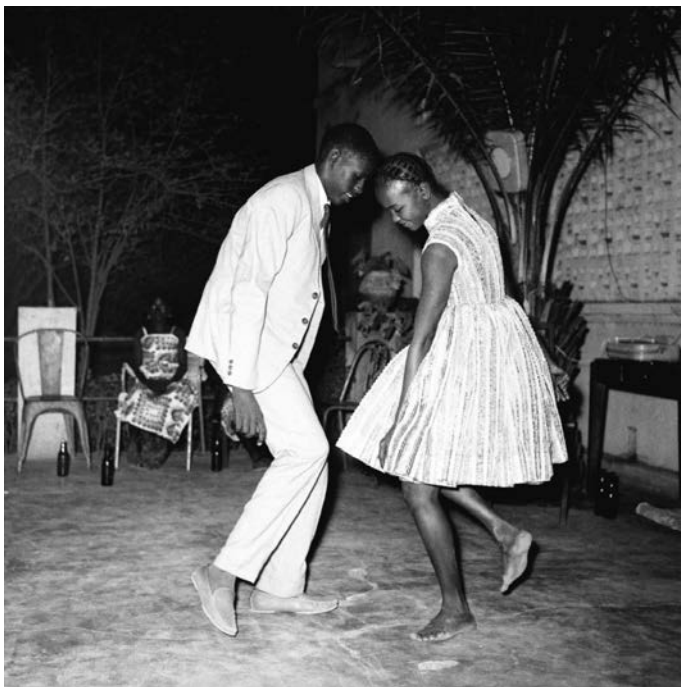
Nuit de Noël (Happy Club), 1963 Tirage argentique baryté

By the 1970s, the photographer had moved away from observational documentary to focus on studio work. He draped his tiny workspace with fabrics and filled two large boxes with hats and ties so that his sitters could accessorise their brilliant outfits at whim.